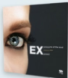
Douglas A. Terry Expressions of the Soul Exposed

292 pp; 914 illus; ©2017; ISBN 978-0-86715-668-3; £120